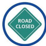
Temporary closures (Carpenter Road)