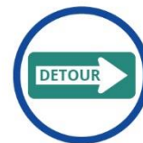
Temporary detours (Ruble Road)