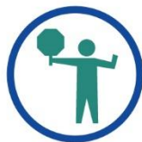
Lane restrictions (one-way traffic control & onsite flaggers)